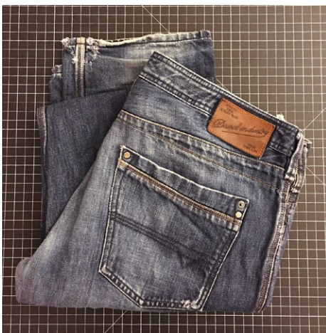
Figure 2. Cut the new back pockets from the back pockets of the recycled jeans, aligning the pattern foldline with the opening edges of the pockets, so that you can make use of the ready-stitched pocket hems.

pants. However, undo the stitching along the side seams at and above the front-hip pocket openings of the new pants to ensure that there is enough fabric for the side seam allowances on the pants backs. The fabric area between the inward-curving pattern pieces for the pants front and back can be left there to add extra wearing ease around the knees. Cut the garment pieces one at a time. Make sure not to place seams of the new pants on the most worn areas of the used jeans.